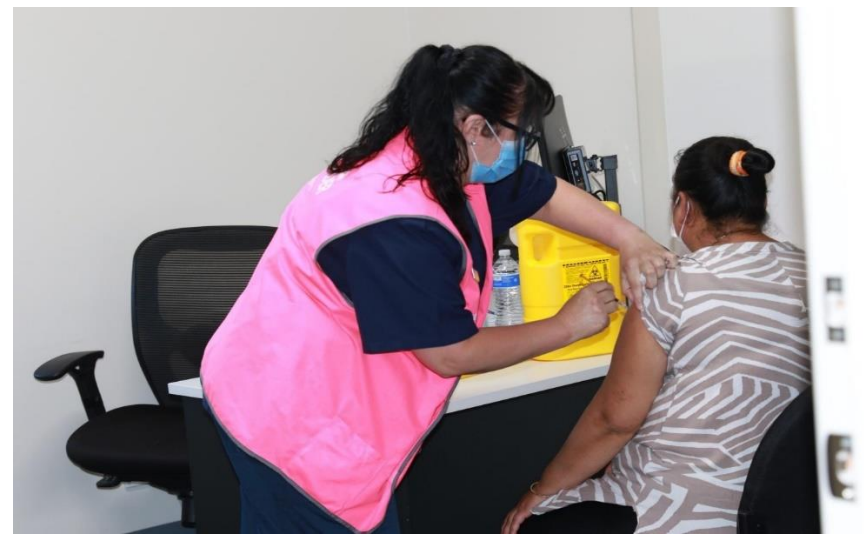
Mobile covid-19 vaccination clinic in conjunction with SA Health

The Bhutanese community in SA has been accessing most of the available COVID related information from the Department of home affairs and SA health both in translated version. However, BAASA believed that the currently available COVID19 information has not accessed by community members, especially, people with disabilities, aged people, and low literacy level.