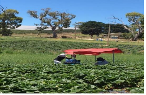
Strawberry Farm, 24 November 2020

BAASA has played the key role to support our community members who have got the very low level of English language level and do not have the appropriate qualification to secure the suitable employments in Australia after arriving from the overseas. We have found that most of the community members who have got the low level of English language are facing the hard time to enter the suitable industries due to lack of local experience though they have got the experiences in various industries from overseas. Many settlement service providers have been assisting the community members to gain the employment opportunities; however, our community members are still facing difficulties to settle well in Australia. BAASA has been assisting the community members to gain the sustainable employment opportunities to enhance their financial independency.