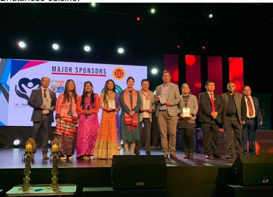
During the 13th Annual Settlement Day-15th May 2021

exhibited their arts and craft for the first time at annual settlement day. During the annual settlement day, newly established businesses within our community have got the platform to promote their business to the broader communities and more importantly, community members were able to connect, network and engaged. The annual settlement day includes cultural dance, presentation, and the taste of Bhutanese cuisine.