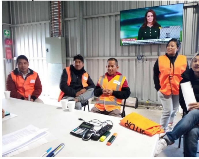
During induction on 20 June 2021 at Le Fresh Company

BAASA also assisted the community members to prepare resume, learn techniques to face job interviews and other related skills.