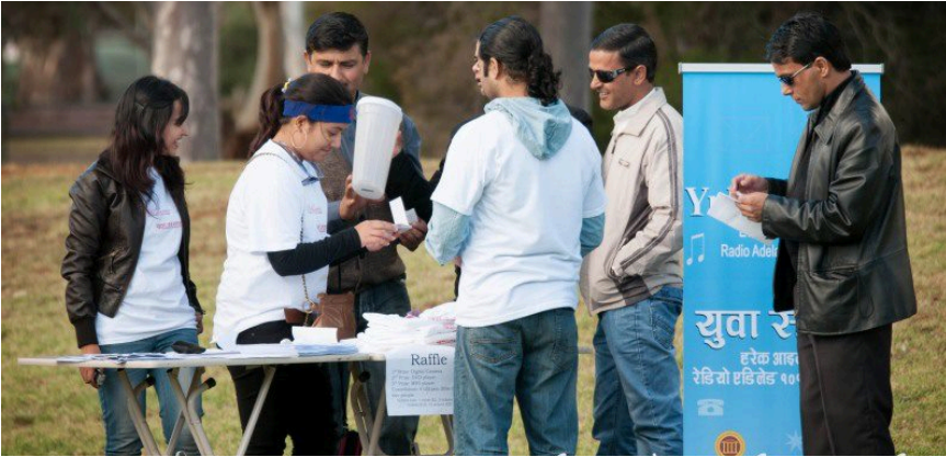
Yuba Sansar team members involved in Annual Settlement Day Celebration

It was a great pleasure and a matter of pride for Yuba Sansar team members to be honoured from dignitaries present on that day with the certificate and scarf for providing selfless service in favour of Bhutanese settlement in South Australia.