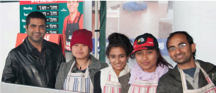
Yuba Sansar team members in BBQ